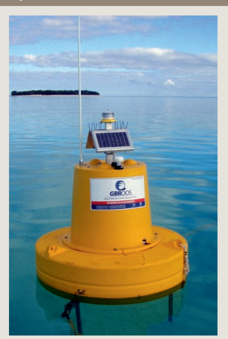
One of the sensor floats that makes up the IMOS sensor network at Heron Island, infrastructure which forms part of the Facility for Automated Intelligent Monitoring of Marine Systems (FAIMMS).

The voyages SS07/2007, SS09/2008 were funded by the Marine National Facility, Integrated Marine Ocean Observing System and National Geographic. <sup>1</sup>