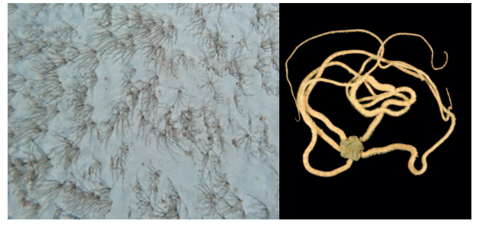
An AUV captured image of the brittle star community at Hydrographers Passage (2 metres from the seabed). Right: the flashing brittle star with its extensive feeding arms. University of Sydney

The aggregations of O. pantherina are a living example of the suspension feeding communities that once flourished, 500 million years ago, in the Palaeozoic era. These ancient communities eventually declined because of the diversification of predators, and it is due to this predation pressure – mainly from fishes – that