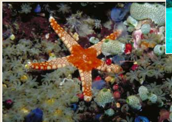
Starfish provide another splash of colour to the Great Barrier Reef