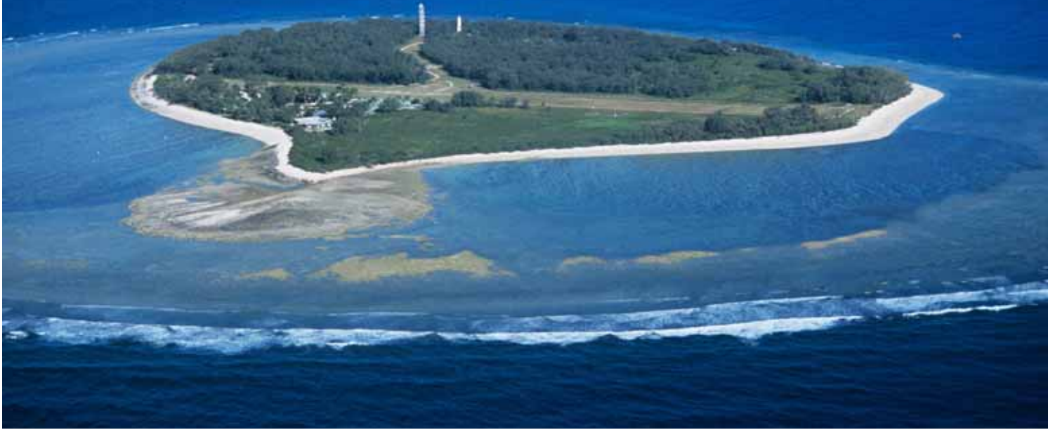
Lady Elliot Island

With a helping hand from the GBRMPA, Lady Elliot Island Resort and Low Isles have had a green makeover to reduce energy consumption and carbon emissions.