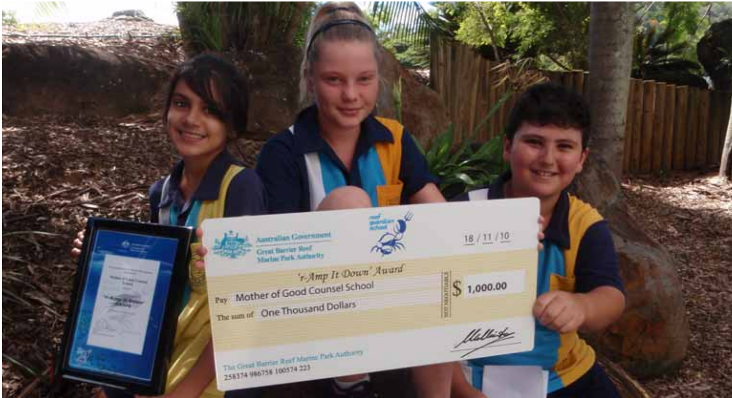
Mother of Good Counsel School received the Reef Guardian 'r-Amp It Down' award