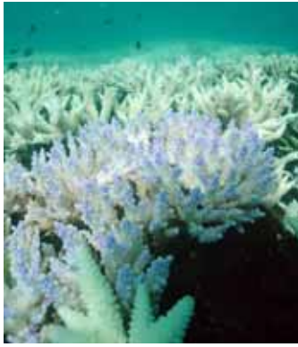
Cover: Bleached staghorn corals on Keppel Island Reefs with fluorescent purple tipped corals in foreground.